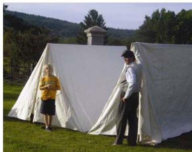
Civil War Camp 2007

Living History Civil War Camp (July 18-20, 6 p.m. to 10 a.m.) takes kids back to the 1860s to live as they would have in the Confederate Army. Learn drills, history and the roles of men in the company. For children ages 9-14. Demonstration for parents on Sunday morning. $50 includes all food and beverage.