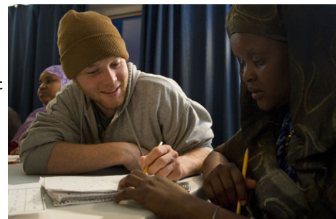
Service learning students are paired with immigrants to help them make a smoother transition to life in the US.

Therefore, if you have a program idea that you would like for us to develop, please contact me at (276) 694.0296 or by email at kdunkley@vt.edu .