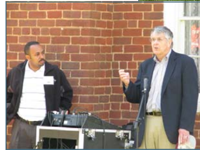
Thanks to all who worked at, donated to, or attended our first annual Hokie Day at the Homestead—it was a resounding success!